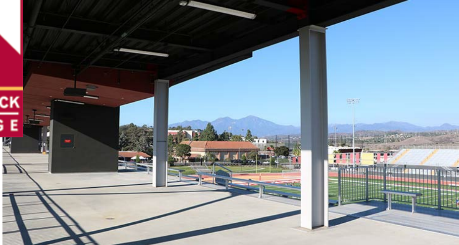
Viewing Deck Below Pressbox